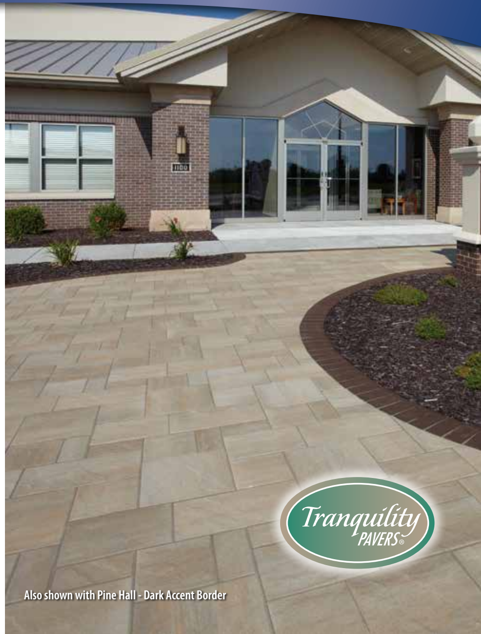
Also shown with Pine Hall - Dark Accent Border