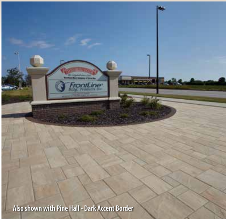
Also shown with Pine Hall - Dark Accent Border