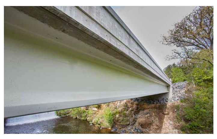
County Materials' experienced dispatch and fleet team coordinates precise delivery schedules and overcomes site challenges to minimize transportation disruptions.