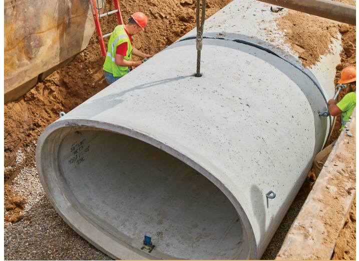
Elliptical Concrete Pipe