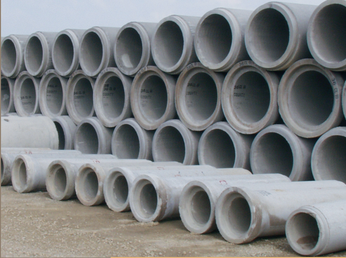
Round Concrete Pipe