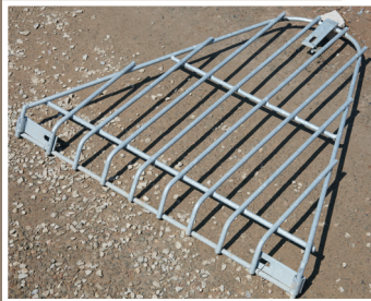
Heavy Duty Trash Guard