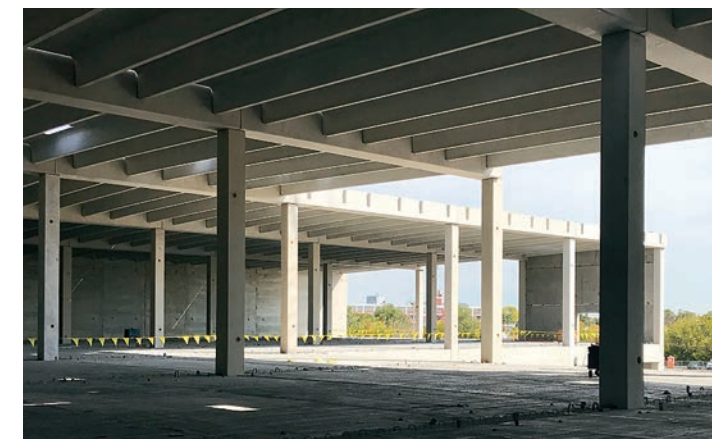
Precast Columns and Beams