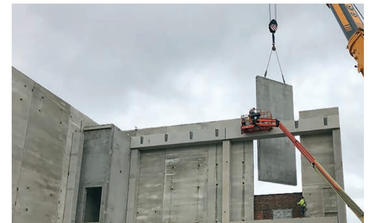
Insulated Wall Panels