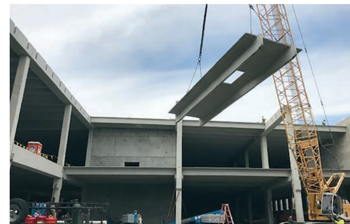
Prestressed Concrete Double Tees