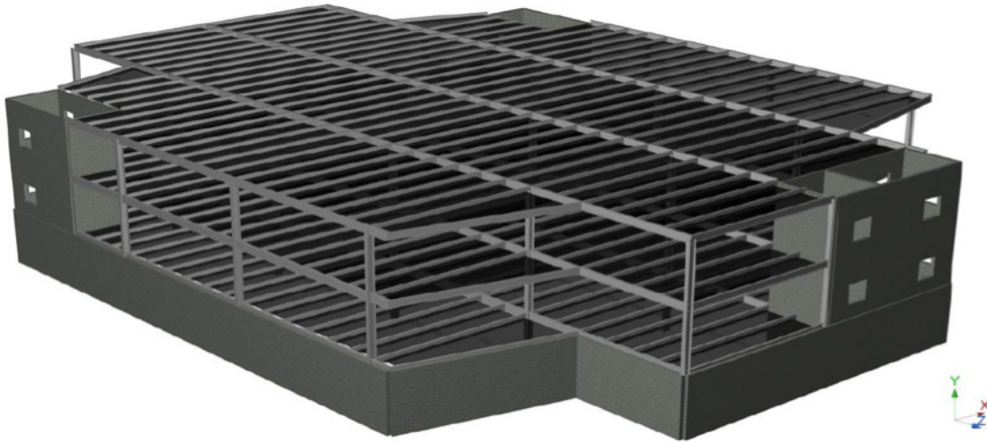
Figure 3 - The 8-inch masonry design for the shear walls of the elevator shaft and stair towers were not only sufficient in this model, but required no additional reinforcement for lateral design load combinations.

masonry design, and stair and elevator shafts. As a result 8-inch masonry is more effective for masonry shear walls, and more accurate analysis is leading to more accurate and efficient design.