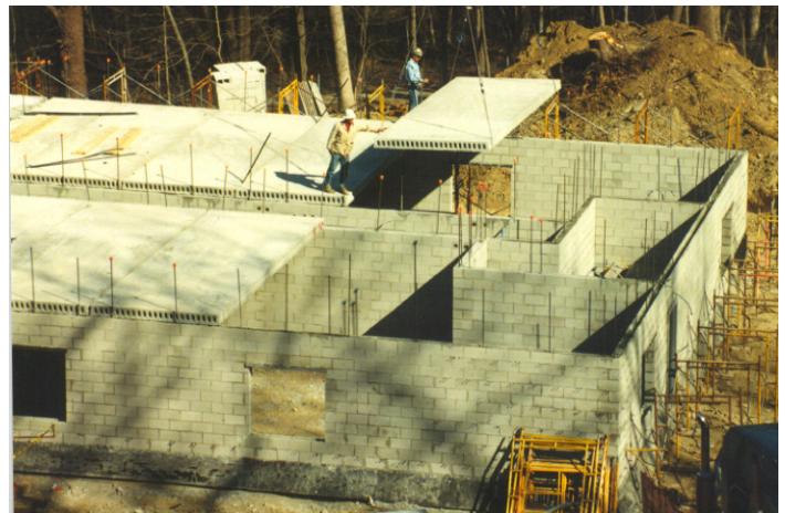
Figure 2 - Good example of interior loadbearing walls.

With non-loadbearing walls loaded with in-plane shear such as the Hybrid Masonry Design (Type I), when the vertical load is supported by the steel frame and not by the masonry, additional reinforcement will be required so the wall can act in shear (Figure 2). With Hybrid Design, the cost of adding a few bars to the ends of the CMU infill walls is easily offset by allowing engineers to eliminate cross braces to save the project significant costs and allow the designer freedom to locate openings.