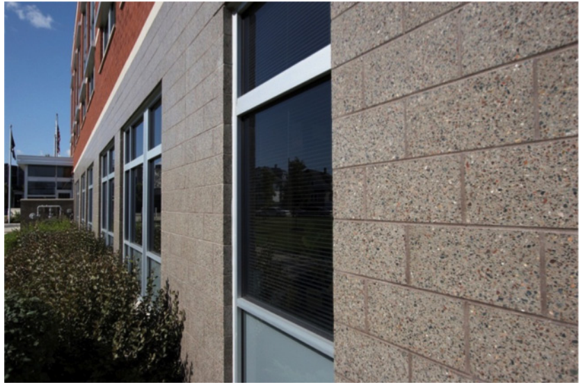
Figure 4 - Ground-faced structural masonry used with modular design dimensions to enhance aesthetics and create lower masonry cost. 5

Engineering professionals must get educated on their own by a good mentor and/or continuing education programs offered by reputable masonry industry groups such as International Masonry Institute (IMI) and the National Concrete Masonry Association (NCMA). Unfamiliarity with current software programs is common because masonry analysis and design features are relatively new in finite element analysis programs. However, software vendors offer education for their software programs and IMI offers general masonry design training including design based on using software programs all across the country. Today there are ample opportunities to become educated about masonry software programs.