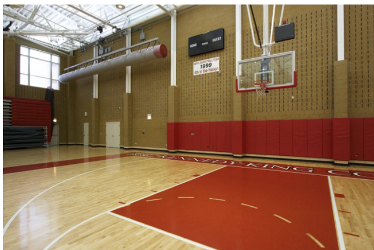
Figure 1 - Aesthetic 8-inch masonry wall in school gymnasium. 5

Using proven masonry design practices you will find there is no need to unnecessarily thicken the wall or replace masonry with one of its closely related cousins, cast-in-place concrete or concrete precast elements at a premium cost. Again, there are situations that may warrant this, but when the client is requesting an aesthetically pleasing "exposed" structural element like masonry, it is important to have an in-depth knowledge of what can be designed with masonry, rather than have your client find out later that a change was made without sound reasoning.