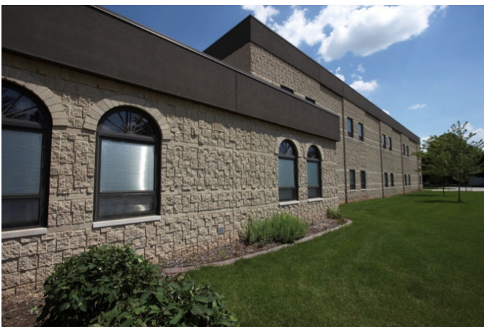
Figure 5 - Structural and decorative “Castle Rock” CMUs creates efficient use of masonry material and architectural expression. 5