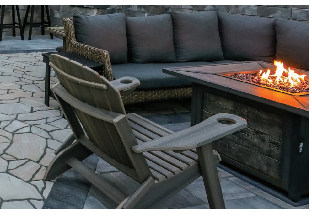
Destination Pavers in Intention, Grand Discover Pavers in Timeless, Elements Paving Stones (4x8) in Reflection, Tribute Smooth Retaining Wall System in Timeless