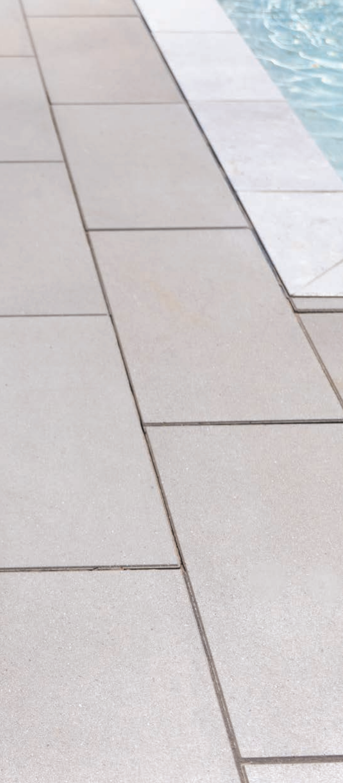
Grand XL Discover Pavers in Vision