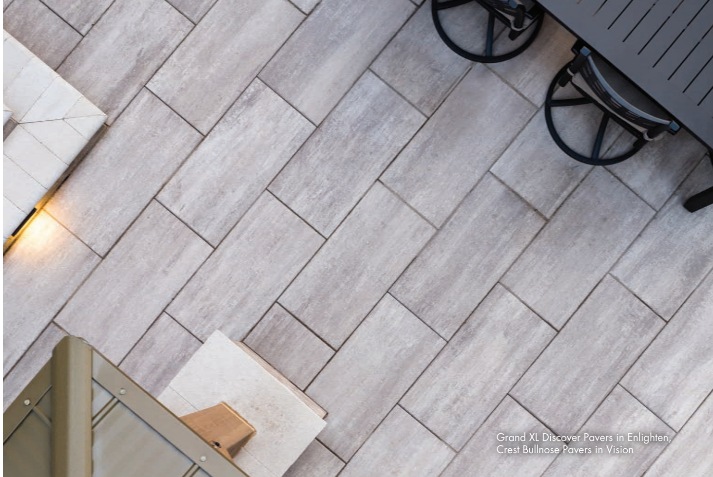
Grand XL Discover Pavers in Enlighten, Crest Bullnose Pavers in Vision