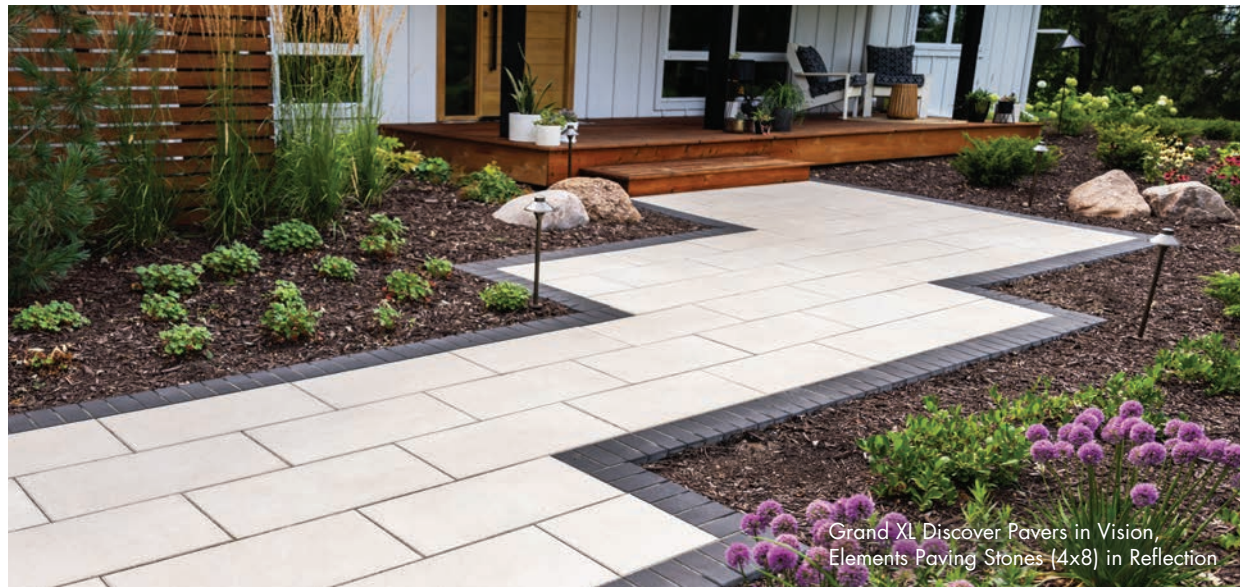
Grand XL Discover Pavers in Vision, Elements Paving Stones (4x8) in Reflection