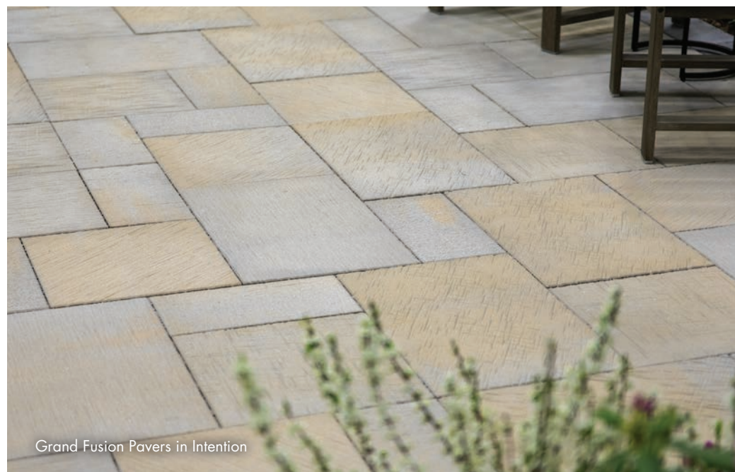
Grand Fusion Pavers in Intention