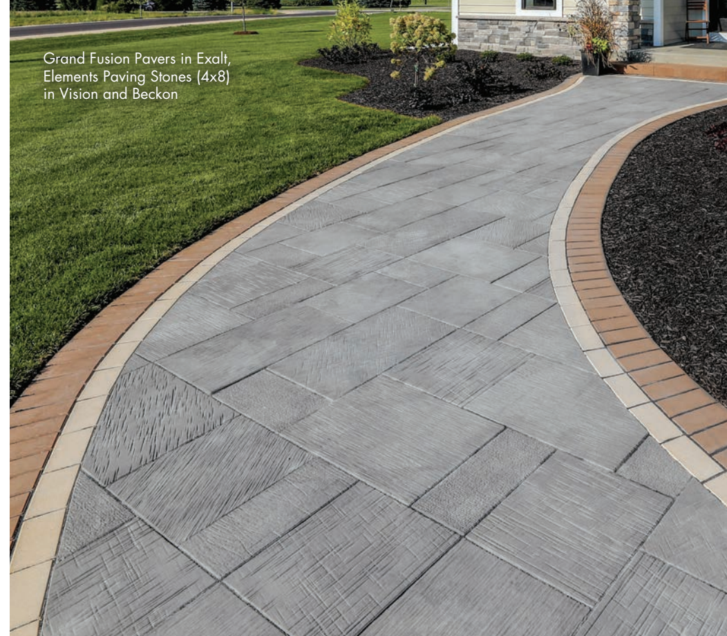
Grand Fusion Pavers in Exalt, Elements Paving Stones (4x8) in Vision and Beckon