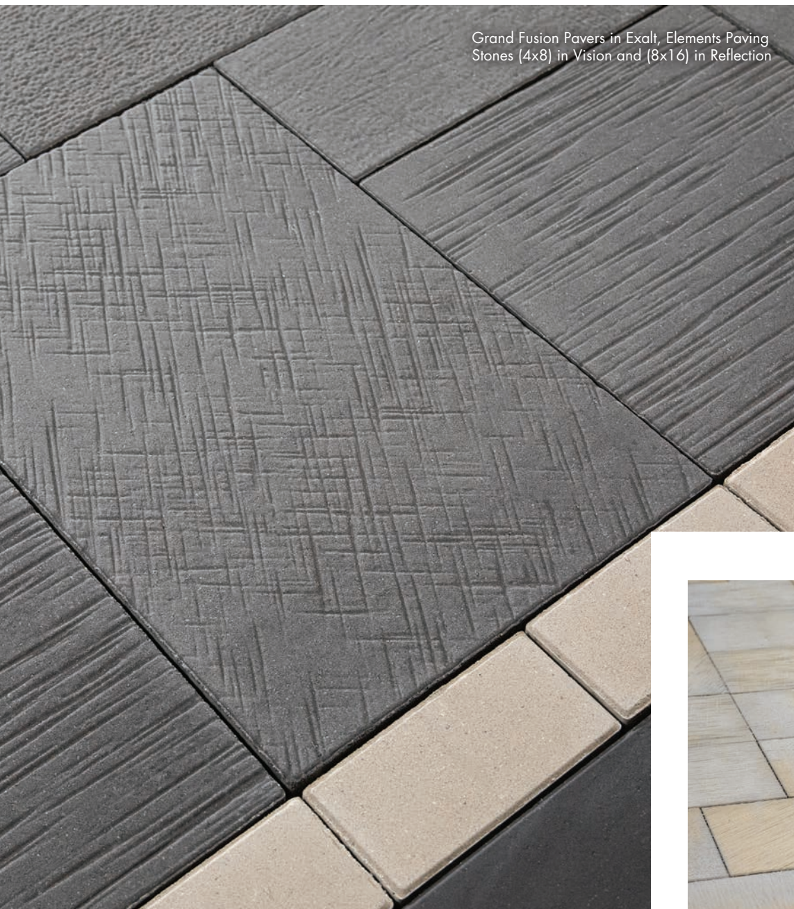
Grand Fusion Pavers in Exalt, Elements Paving Stones (4x8) in Vision and (8x16) in Reflection