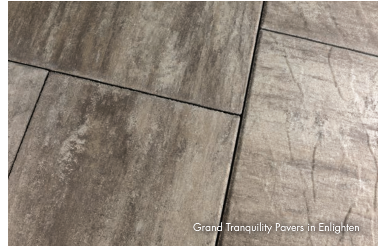
Grand Tranquility Pavers in Enlighten