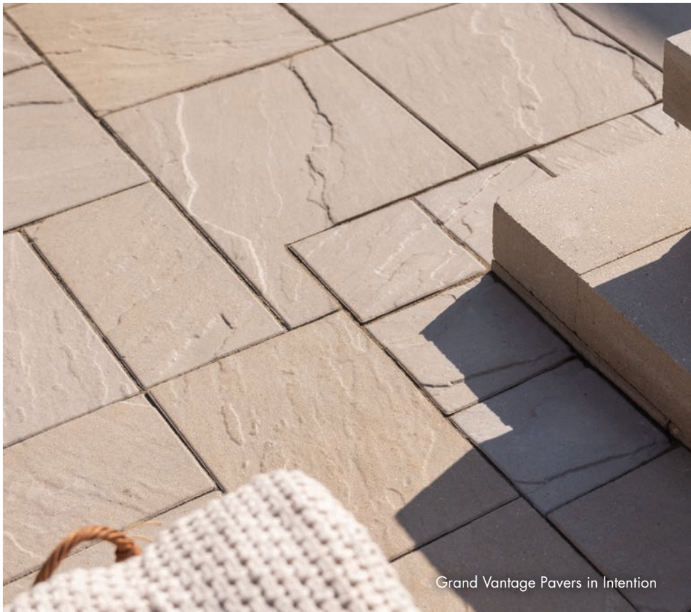
Grand Vantage Pavers in Intention