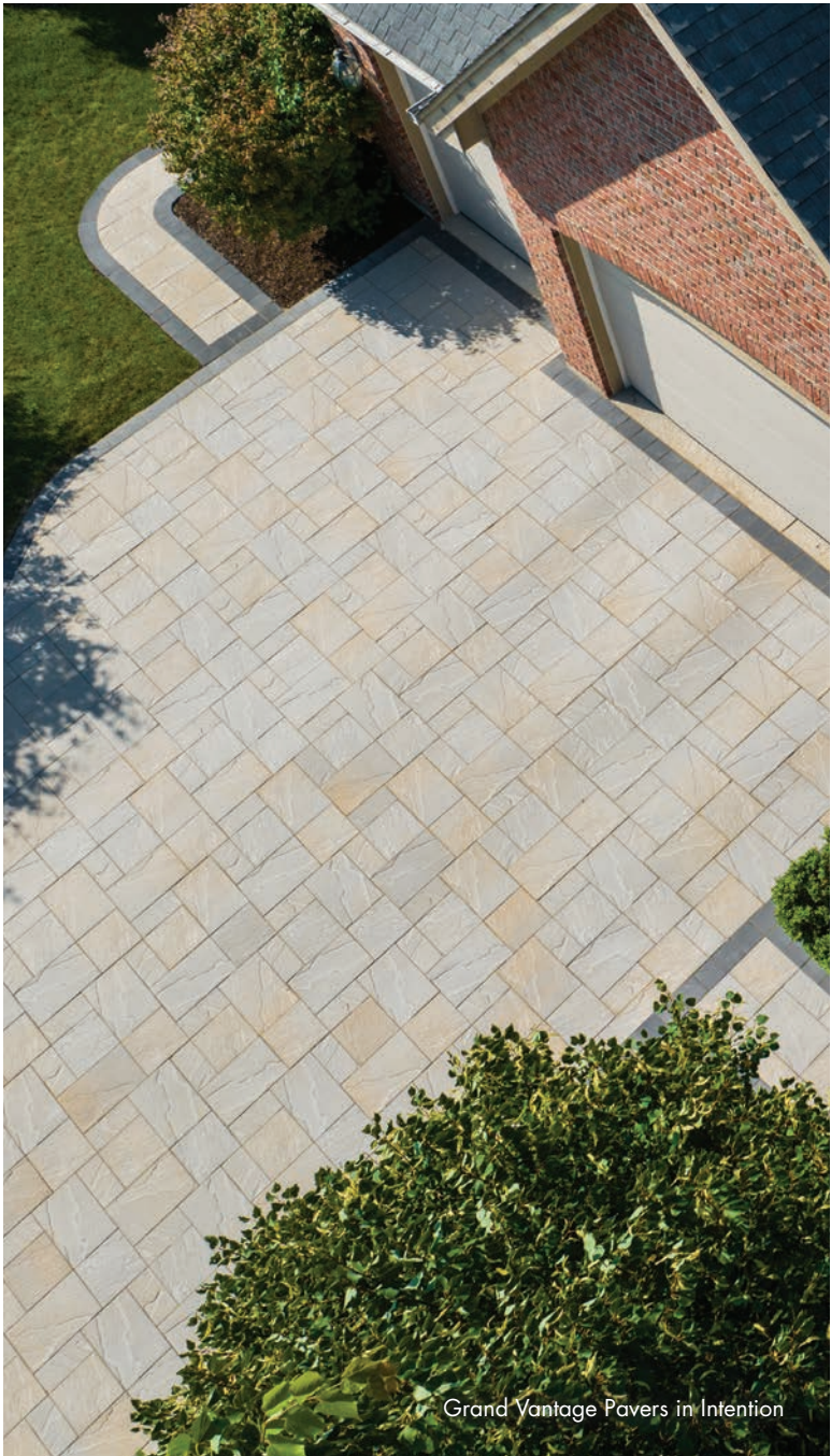
Grand Vantage Pavers in Intention

Aspect Ratop Disclaimer: County Materials unit pavers "slab(s)" do not meet aspect ratio for vehicular application, as defined by CMHA standards. It is the responsibility and discretion of Buyer, Owner, Contractor, Architect, or Engineer to determine whether these unit pavers "slab(s)" are suitable for the specific project. County Materials recommends consulting with a qualified professional to assess the suitability for the project. County Materials Corporation accepts no responsibility or liability for the use of unit paver "slab(s)" in a vehicular application.