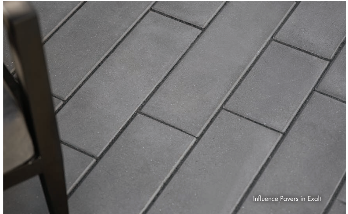
Influence Pavers in Exalt