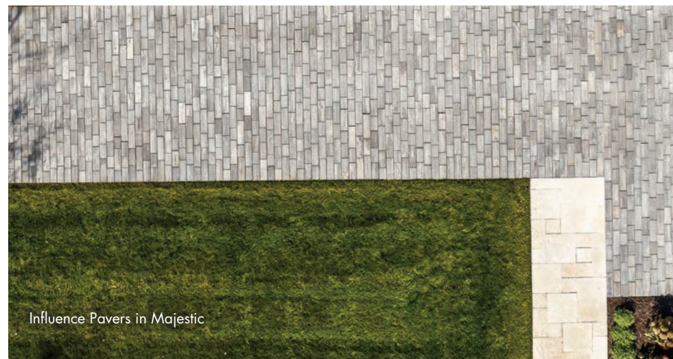
Influence Pavers in Majestic

Aspect Ratop Disclaimer: County Materials unit pavers "slab(s)" do not meet aspect ratio for vehicular application, as defined by CMHA standards. It is the responsibility and discretion of Buyer, Owner, Contractor, Architect, or Engineer to determine whether these unit pavers "slab(s)" are suitable for the specific project. County Materials recommends consulting with a qualified professional to assess the suitability for the project. County Materials Corporation accepts no responsibility or liability for the use of unit paver "slab(s)" in a vehicular application.