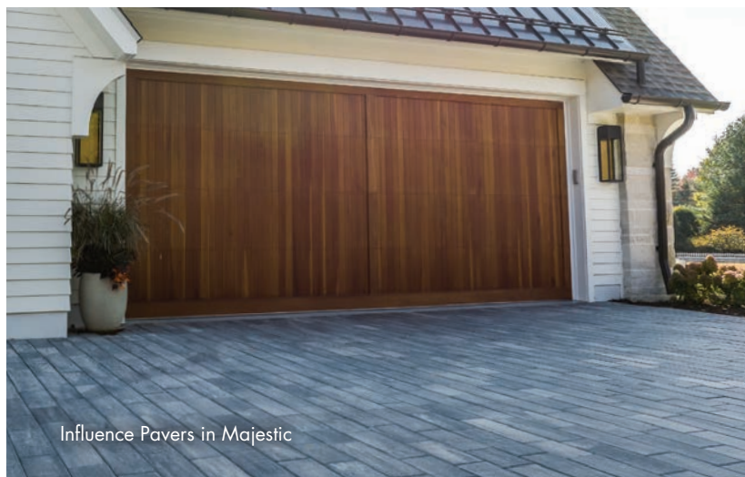
Influence Pavers in Majestic