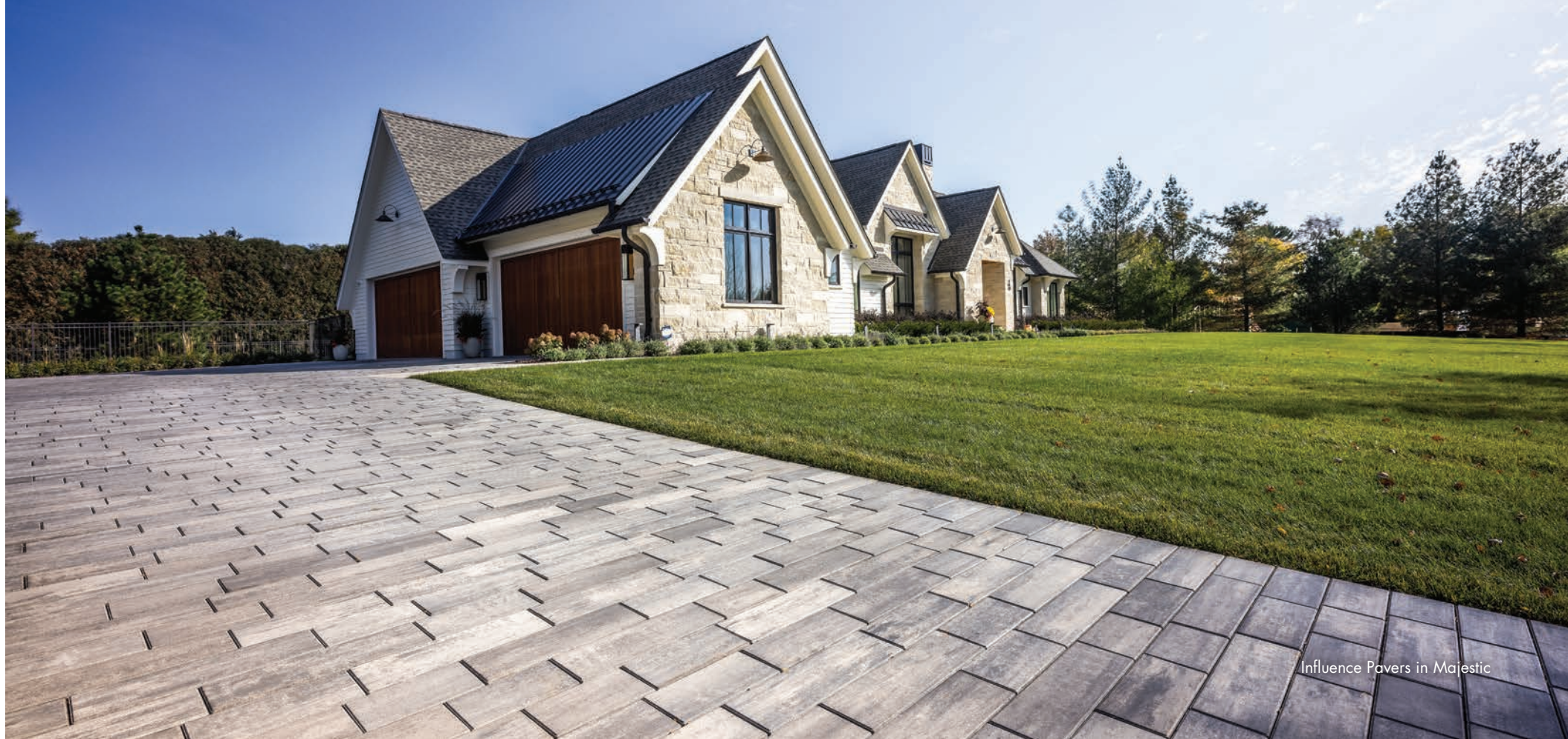
Influence Pavers in Majestic