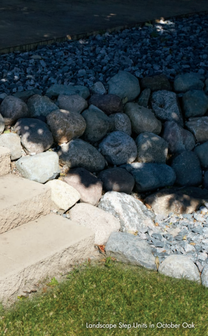
Landscape Step Units in October Oak