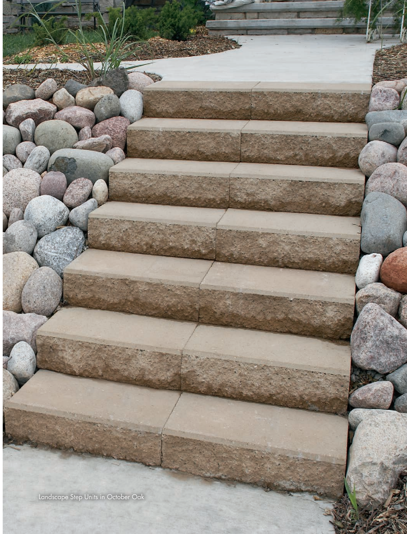
Landscape Step Units in October Oak