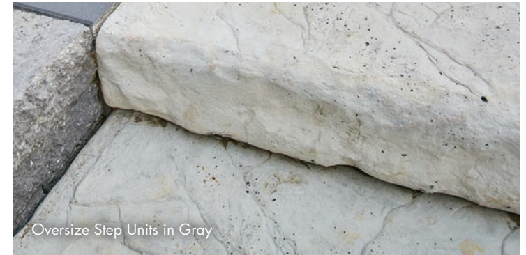
Oversize Step Units in Gray