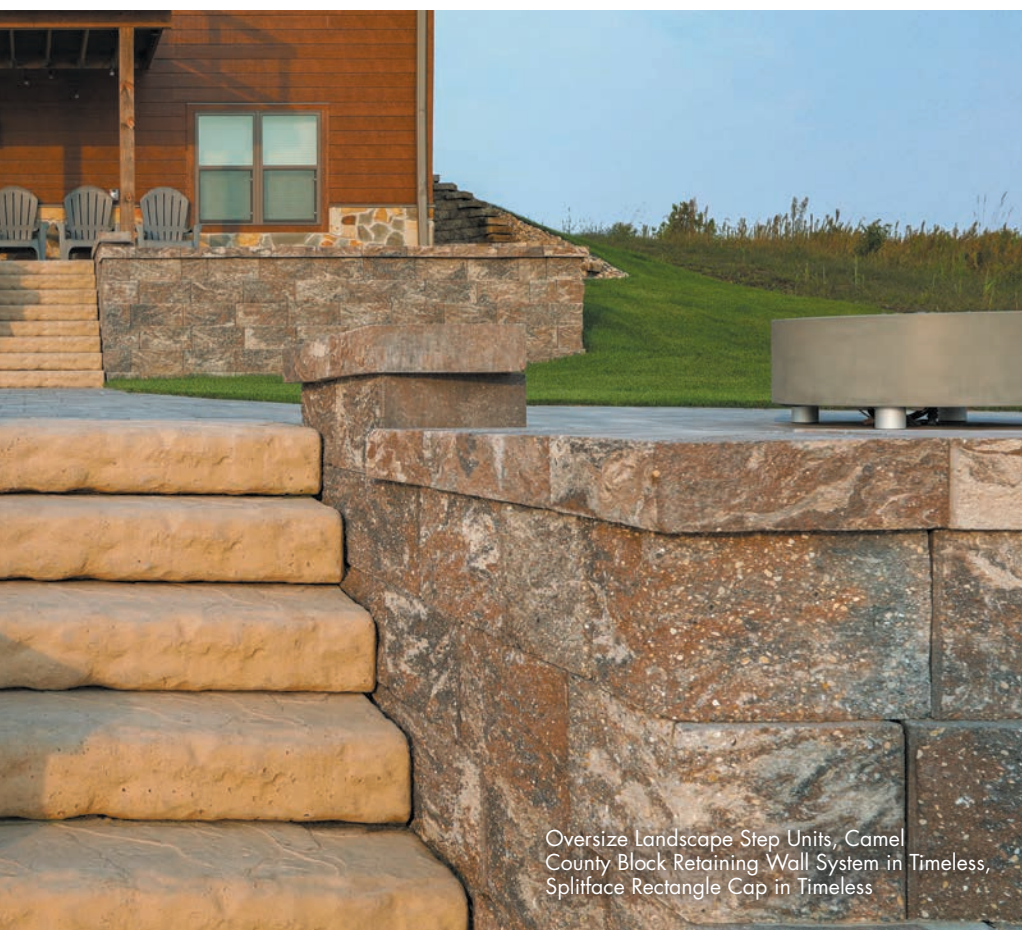
Oversize Landscape Step Units, Camel County Block Retaining Wall System in Timeless, Splitface Rectangle Cap in Timeless