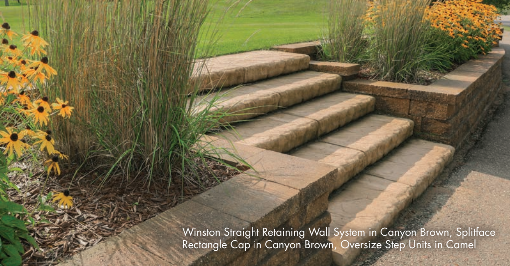
Winston Straight Retaining Wall System in Canyon Brown, Splitface Rectangle Cap in Canyon Brown, Oversize Step Units in Camel